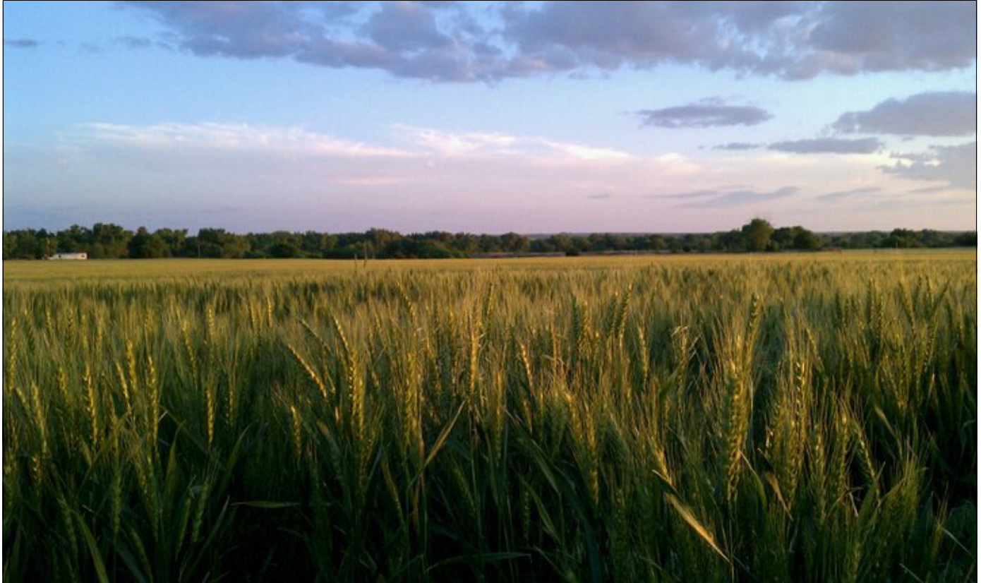
A beautiful Western Kansas wheat field!