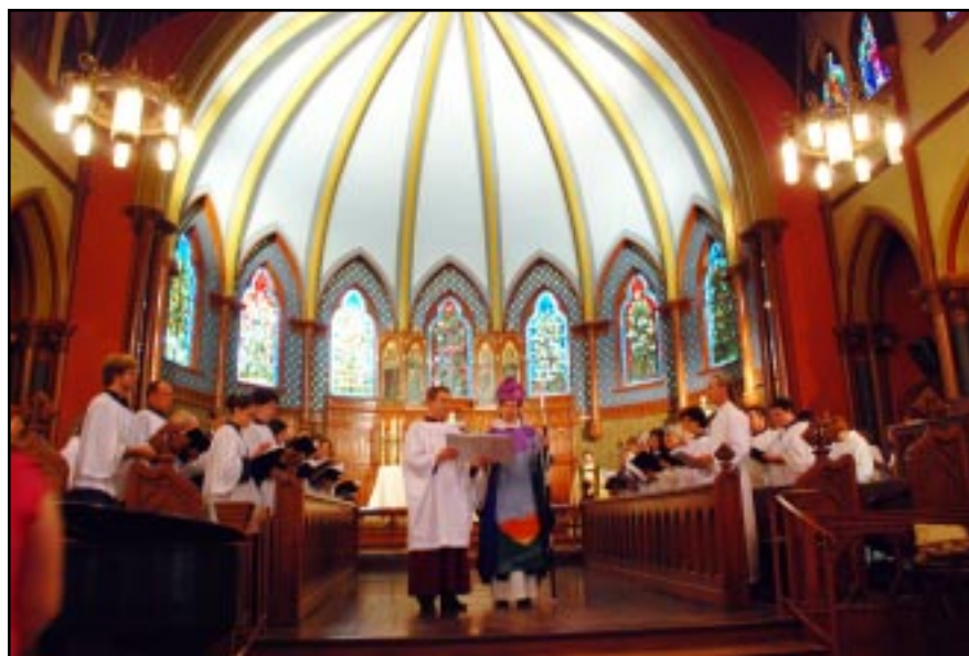
Celebrating the Eucharist in New Orleans, courtesy Episcopal Life Online.

At stake were several contentious issues which have divided the churches within the Anglican Communion, since the ECUSA’s General Conventions of 2003 and 2006: the election of a bishop in a devoted gay relationship; the public blessing of gay couples; the intervention of foreign bishops in dioceses of the Episcopal Church.